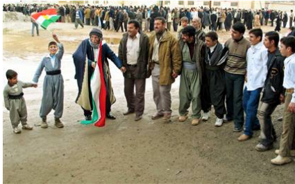
Traditional and Modern Dress for Kurdish men in Iraq