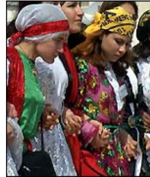
Traditional dress for Kurdish women in Turkey.