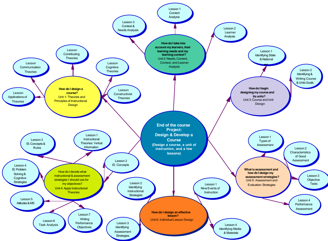
Figure 2. Course units & lessons

In order to help students identify their own learning styles and study skills and to know one another better, they were directed to complete and post a brief autobiographical sketch with their pictures in the “common forum” (the synchronous and asynchronous discussion area). The autobiographical assignment page provided students with questions that they could consider in preparing their autobiography. It also provided links to other sites where students could self assess their own learning styles, thinking styles, and study skills and report the results in their autobiographical sketch. In order to make the project drive the learning needs, the course home page and project were also linked to different course units and lessons. Although a sequence in the presentation of units and lessons was suggested in order to manage the course and organize the readings and interactions, all units and lessons were made available to students in case they wanted to explore them on their own and out of the given order. For each unit or related lesson(s), a list of reading assignments was recommended. To help students develop a common knowledge base, they were further instructed to read the designated reading materials before the scheduled lessons or units, and to post a synthesis summary as an individual assignment.